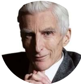
Sir Martin Rees

So it's these robotic spacefarers, not those of us comfortably adapted to life on Earth, who will spearhead the post-human era. Moreover, if post-humans make the transition to fully inorganic intelligences, they won't need an atmosphere. And they may prefer zero g — especially for constructing massive artifacts. So it's in deep space that non-biological "brains" may develop powers that humans can't even imagine.